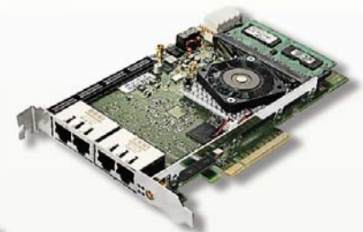
NT4E-4T: 4 x 1 Gbps PCIe