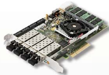
NT4E-4: 4 x 1 Gbps PCIe