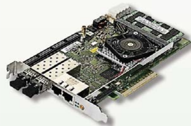
NT4E-2+2T: 4 x 1 Gbps PCIe