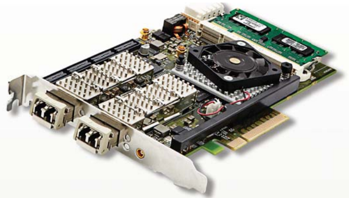
NT20E: 2 x 10 Gbps PCIe

The NT20E Capture Adapters provide deep packet inspection (DPI), flow analysis and protocol processing capabilities that can accelerate network applications and off-load the server CPU by taking care of layer 2 to 4 network traffic analysis. This enables OEM customers to build or upgrade their products to become high-performing full-line-rate 20 Gbps network monitoring/analysis systems by using the NT20E Capture Adapter and a standard Linux, FreeBSD or Windows server.