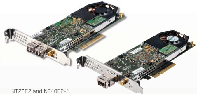
NT20E2 and NT40E2-1

The intelligent feature set off-loads processing and analysis of Ethernet data from application software while ensuring optimal use of the standard server's resources leading to effective application acceleration.